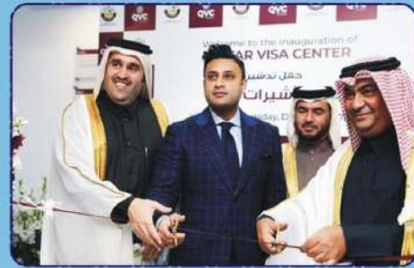
Inauguration of Qatar Visa Center Islamabad

The State of Qatar has selected Pakistan to be one of the eight counties for establishment of Qatar Visa Centers to facilitate expatriates to complete Qatar Residency Permits in Pakistan. The project covers procedures including fingerprinting, biometric data processing, medical examination and signing work contracts of emigrants in Pakistan to enable them to start jobs immediately after arrival in Qatar. Moreover, migration cost incurred on services will be borne by the employers. Qatar Visa Center at Islamabad and Karachi have started operations.